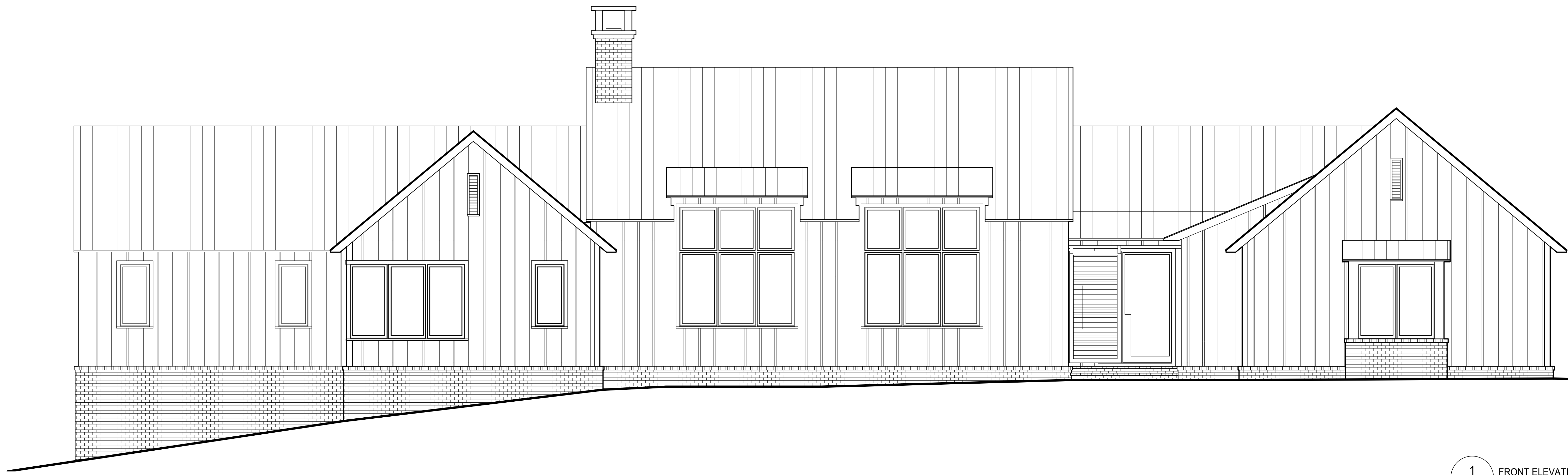
1 A-3.100 FRONT ELEVATION SCALE: 1/4" = 1'-0"