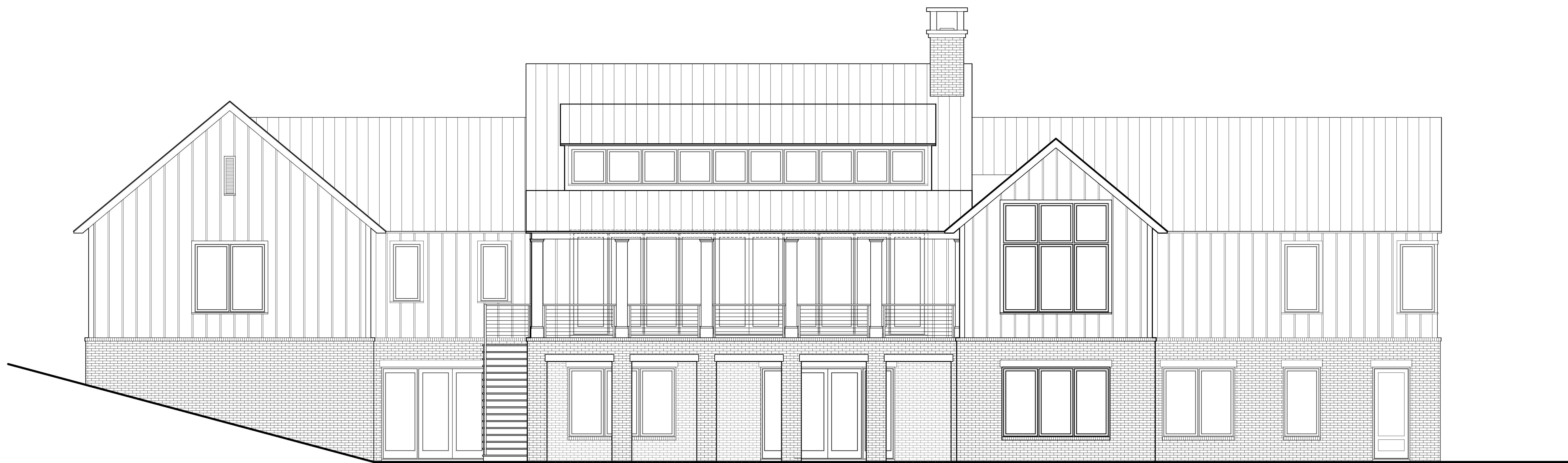
1 REAR ELEVATION A-3.101 SCALE: 1/4" = 1'-0"