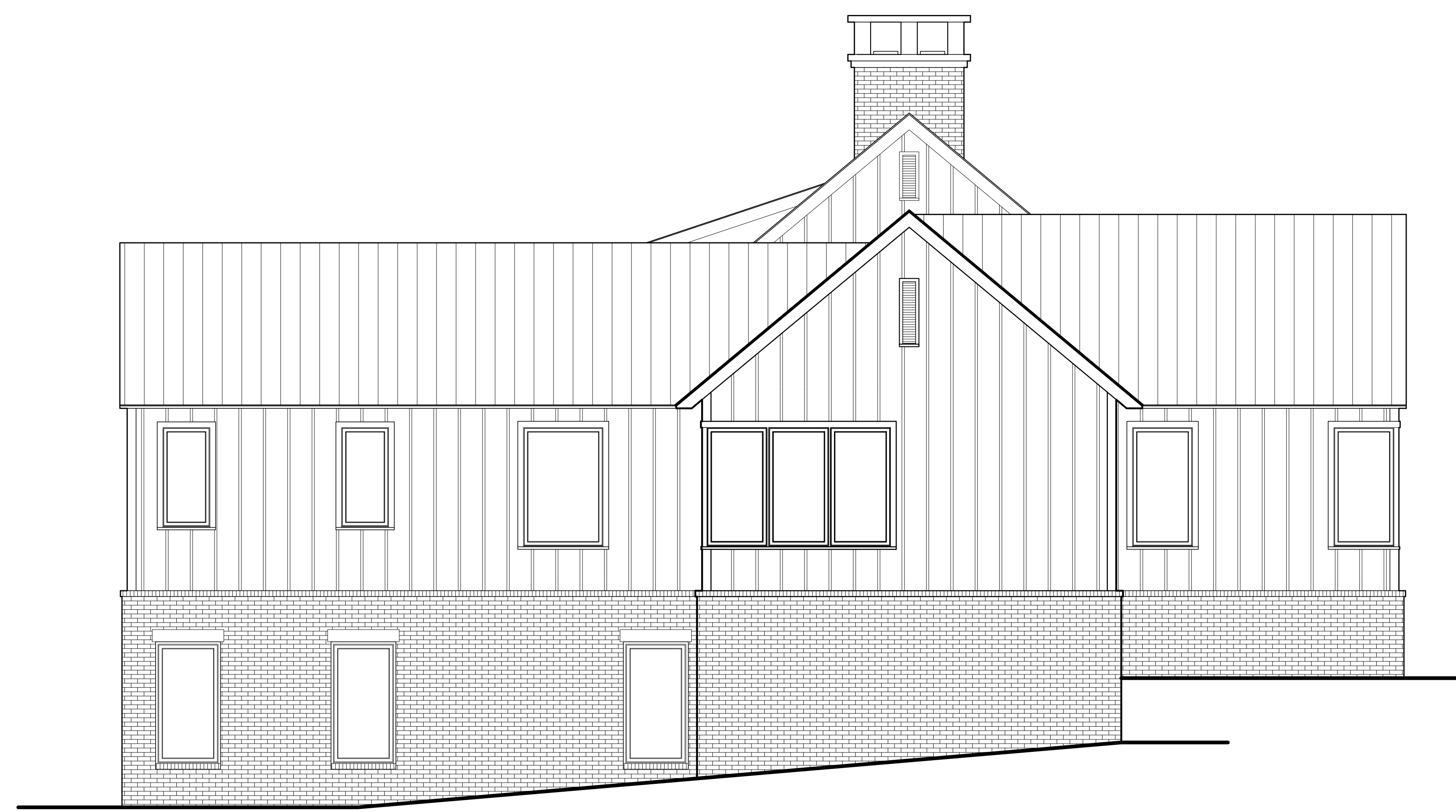
2 A-3.100 LEFT SIDE ELEVATION SCALE: 1/4" = 1'-0"